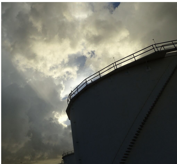
Figure 1. Bad weather scenario with AST.