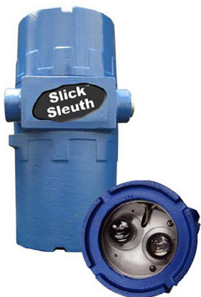
Figure 5. Slick Sleuth SS100 oil detector.

Sensor signal and event alerts can be output to a facility control room via industrial I/O (relays/4-20), and a text message can simultaneously be sent to designated managers and facility personnel to trigger immediate action.