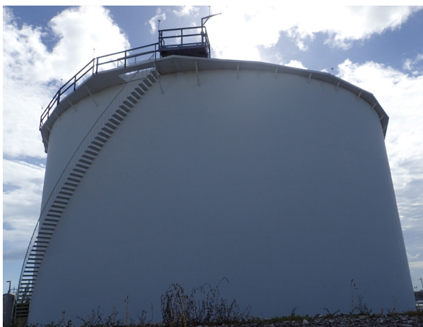
Figure 3. AST with floating roof.

enable their use with a fixed cover. Applications that require absolute control of all emissions from the storage tank now demand the most advanced type of installation, with options for both closed and open roof design.”