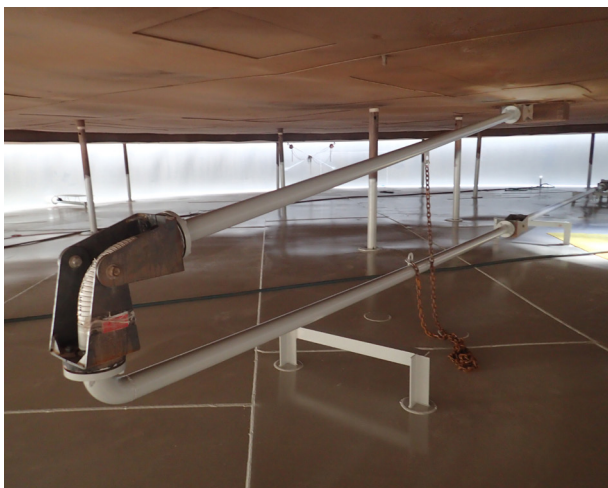
Figure 2. Inside an AST – articulated floating roof drain line.