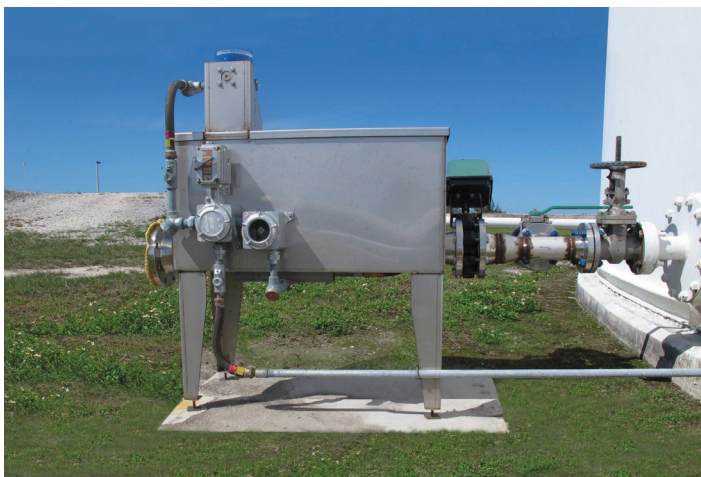
Figure 4. EnviroEye system.