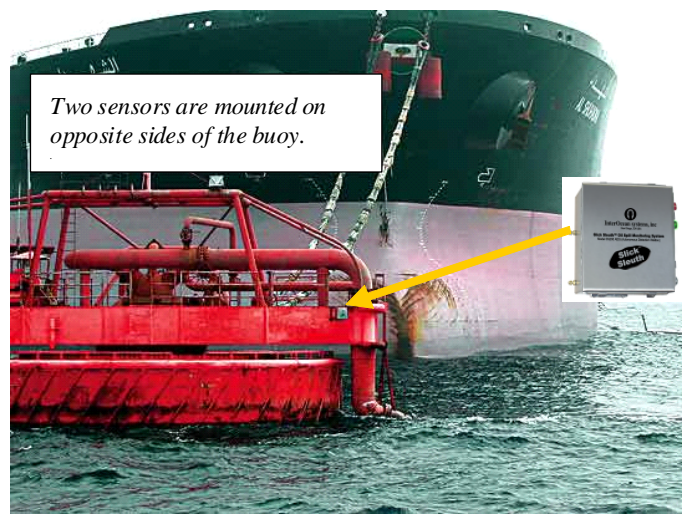
Spill sensors are mounted on the outer circumference of an offshore tanker loading buoy. Two sensors are mounted on opposite sides of the buoy. Oil-on-water alarms are relayed to the tanker vessel to provide near-instantaneous alert of oil spills

The sensor is user-programmable for variable sampling, from a continuous two-hertz sampling mode (for monitoring fast-moving currents) to a periodic sampling mode in which the instrument takes a burst sample (typically 10 samples at 100-millisecond intervals once every five seconds) and the detector analyzes an average of this periodic burst sample.