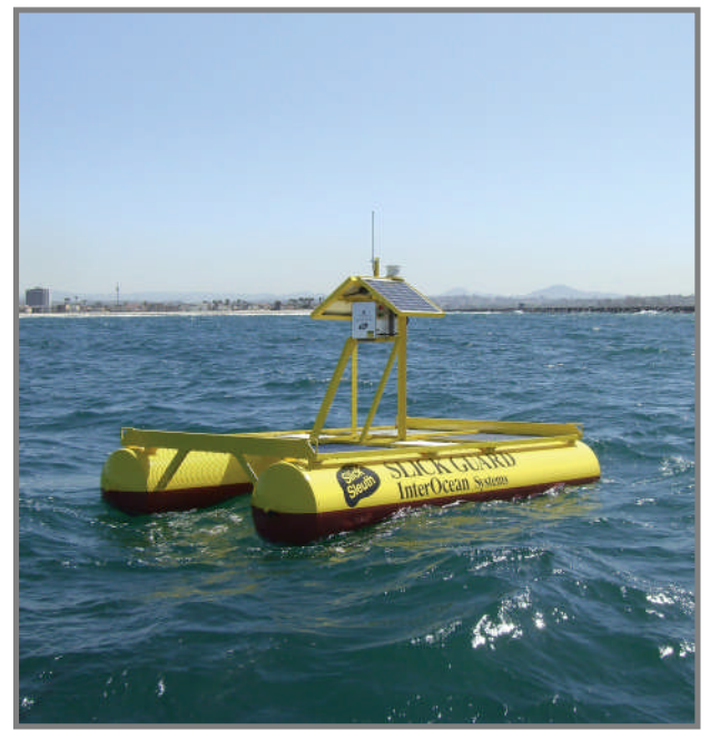
A Slick Guard monitors the water intakes for a desalination plant and a power plant. This system is currently installed in the Middle East.

The Slick Sleuth is designed to provide remote and autonomous operation at a range in excess of five meters above the monitored surface (i.e., tidal range). Engineers have made the package adaptable, scalable and easy to install and operate. Key system attributes include near-zero maintenance and micronlevel sensitivity for a comprehensive range of oils. The system can be installed in a number of environments, including industrial facilities, ports, harbors, coastal areas and offshore. The automated, self-contained sensor systems are either mounted to fixed structures, such as piers, or affixed to buoys, such as the recently developed Slick Guard monitoring platform, which is designed for real-time detection and alert in the nearshore and offshore environment.